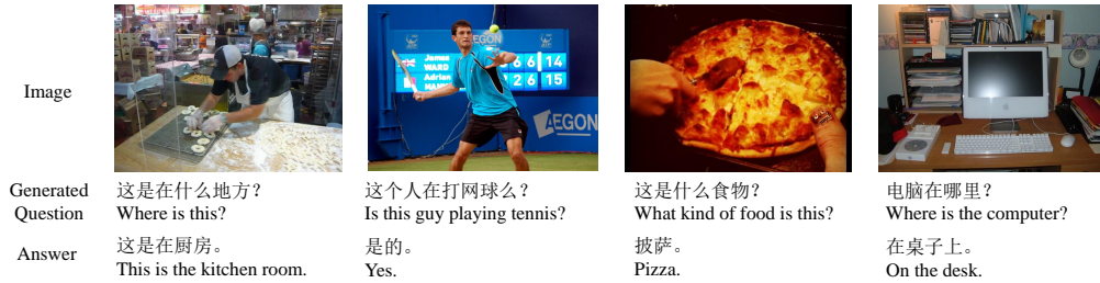
Figure 5: The sample generated questions by our model and their answers.

with the average embedding of the words in the question using word2vec [29]. It is used to show the effectiveness of the LSTM as a question embedding learner and extractor. For the second variant (i.e. “mQA-same-LSTMs”), we use two shared-weights LSTMs to model question and answer. It is used to show the effectiveness of the decoupling strategy of the weights of the LSTM(Q) and the LSTM(A) in our model. For the third variant (i.e. “mQA-noTWS”), we do not adopt the Transposed Weight Sharing (TWS) strategy. It is used to show the effectiveness of TWS.