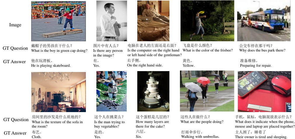
Figure 3: Sample images in the FM-IQA dataset. This dataset contains 316,193 Chinese question-answer pairs with corresponding English translations.

of the questions and answers are 7.38 and 3.82 respectively measured by Chinese words. Some sample images are shown in Figure 3. We randomly sampled 1,000 question-answer pairs and their corresponding images as the test set.