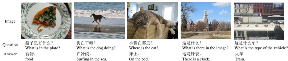
Figure 4: Random examples of the answers generated by the mQA model with score “1” given by the human judges.

In order to show the effectiveness of the different components and strategies of our mQA model, we implement three variants of the mQA in Figure 2. For the first variant (i.e. “mQA-avg-question”), we replace the first LSTM component of the model (i.e. the LSTM to extract the question embedding)