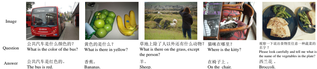
Figure 1: Sample answers to the visual question generated by our model on the newly proposed Freestyle Multilingual Image Question Answering (FM-IQA) dataset.

function. To lower down the risk of overfitting, we allow the weight sharing of the word embedding layer between the LSTMs in the first and third components. We also adopt the transposed weight sharing scheme as proposed in [25], which allows the weight sharing between word embedding layer and the fully connected Softmax layer.