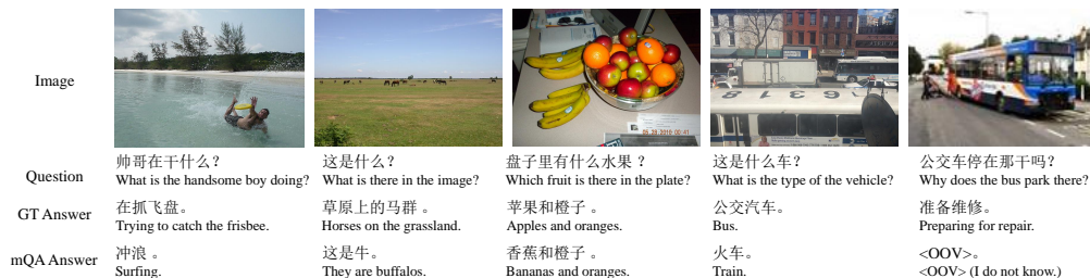
Figure 6: Failure cases of our mQA model on the FM-IQA dataset.

In future work, we will try to address these issues by incorporating more visual and linguistic information (e.g. using object detection or using attention models).